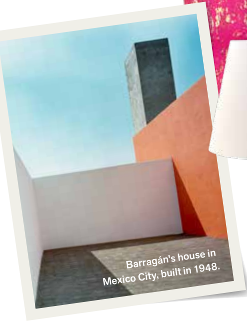
Barragán's house in Mexico City, built in 1948.