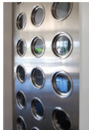
A stainless steel porthole door by Ferra Designs.

REIFICATION This high-end shop for metal fabrication has been a fixture of the San Francisco design scene since 1969; its meticulous products appear in museums and galleries as well as private homes. “They're knowledgeable and experienced,” says designer Steven Volpe, “and their work is always beyond reproach.” 415-553-4183; reification.com.