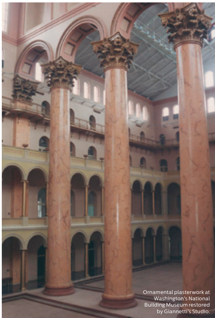
Ornamental plasterwork at Washington's National Building Museum restored by Giannetti's Studio.