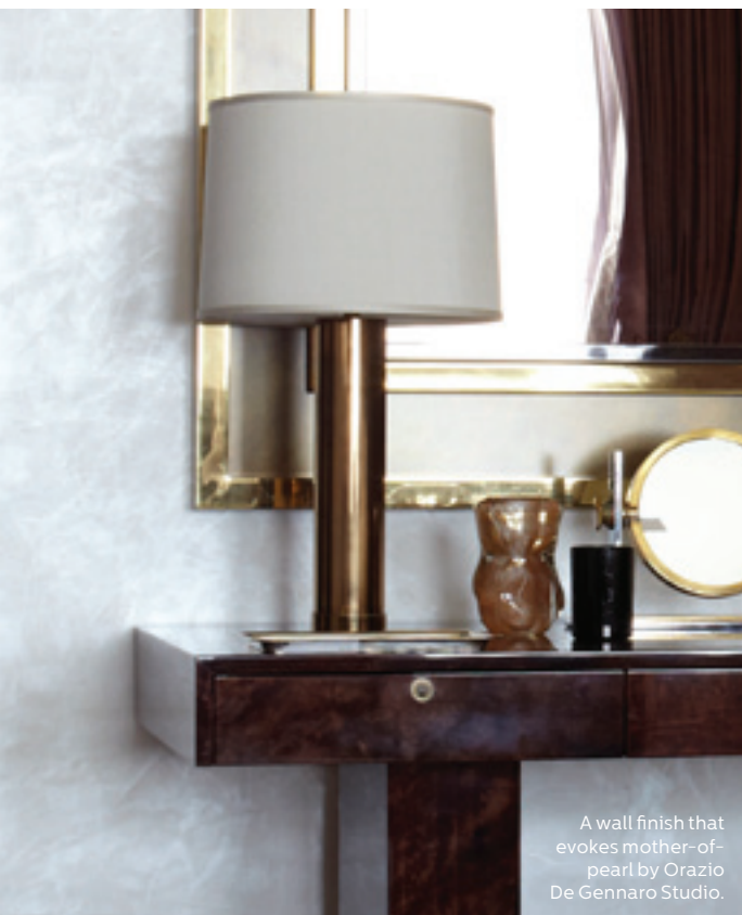
A wall finish that evokes mother-of-pearl by Orazio De Gennaro Studio.