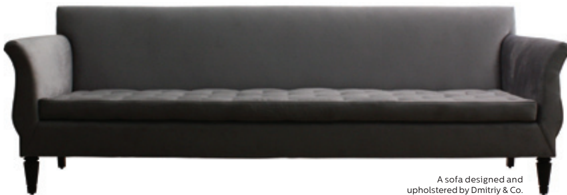
A sofa designed and upholstered by Dmitriy & Co.

EVERY BOARDMAN These upholstery specialists—with showrooms in New York City and Chicago—can customize any of their furniture styles, such as concealing a TV lift in an elegant bed's footboard. 800-634-6647; everyboardman.com.