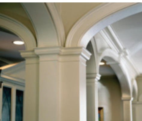
Hull Historical's Federal-style arches and pilasters.