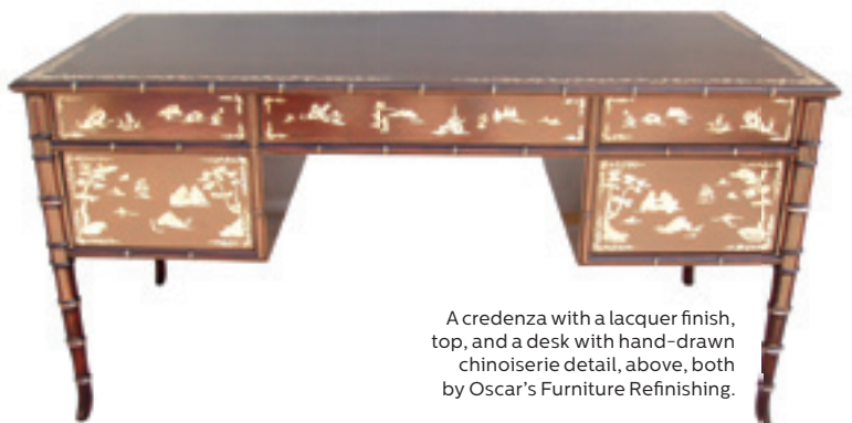
A credenza with a lacquer finish, top, and a desk with hand-drawn chinoiserie detail, above, both by Oscar's Furniture Refinishing.