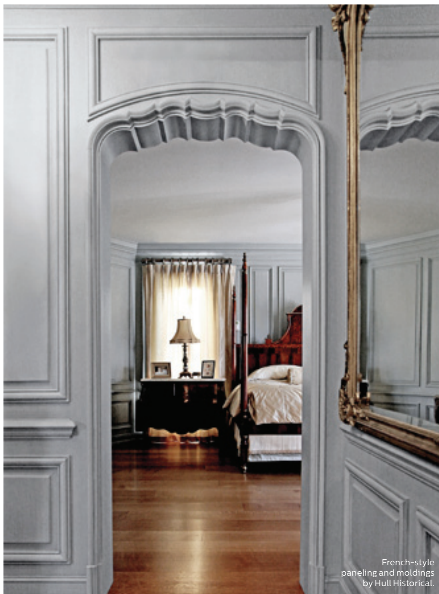
French-style paneling and moldings by Hull Historical.