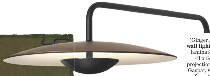
'Ginger A' metal wall light with oak laminate shade, 41 x 55.5cm projection, by Joan Gaspar, €620.40, from Marset