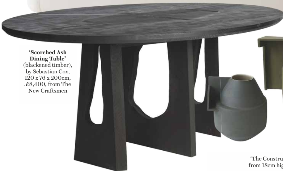
'Scorched Ash Dining Table' (blackened timber), by Sebastian Cox, 120 x 76 x 200cm, £8,400, from The New Craftsmen