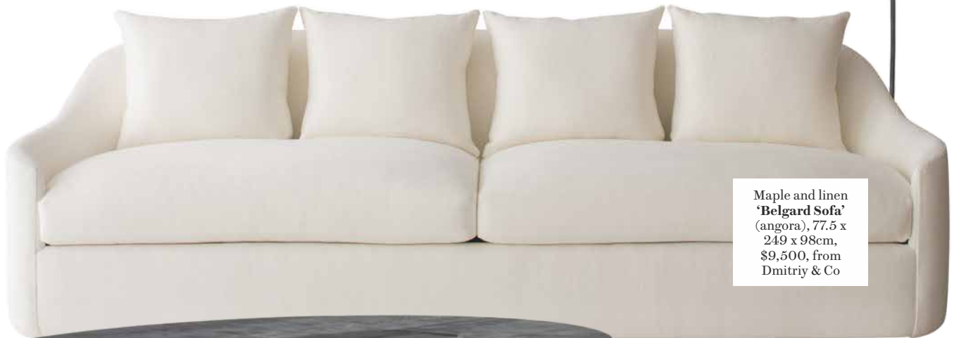
Maple and linen 'Belgard Sofa' (angora), 77.5 x 249 x 98cm, $9,500, from Dmitriy & Co