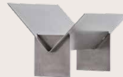
ARTERIORS A modernist moment. Beckett , $450; arteriorshome.com.