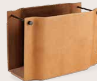
STUDIO A Masculine leather and brass. Serpentine , $399; interiorhomescapes.com.