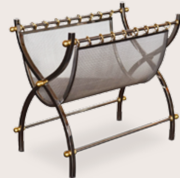
MECOX Mixed metals, classic proportions. Stainless Steel , $625; mecox.com.

Keep reading material smartly at hand with receptacles as good-looking as they are useful.