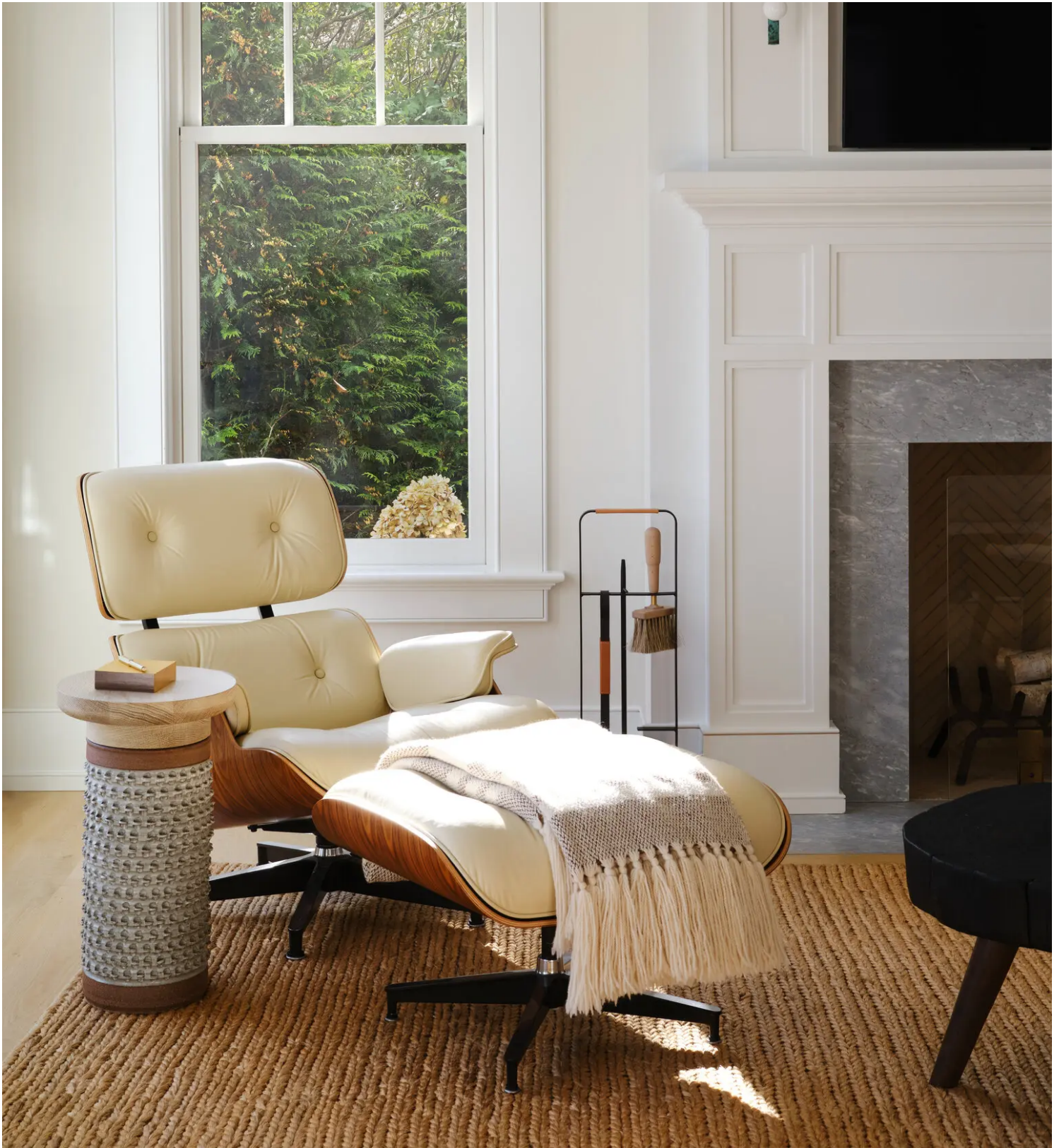
An Eames Lounge Chair and Ottoman (from $4,995) provide a spot to relax by the fire in the living room.

They closed when the house was completed that August, paying $8.55 million.