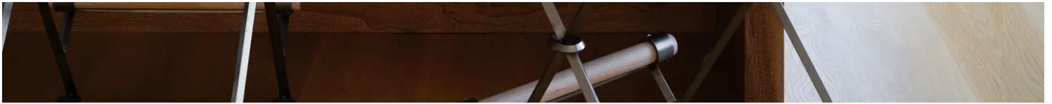
The kitchen island is equipped with Iron and Rolled stools from Thomas Hayes Studio (from $3,500 each).