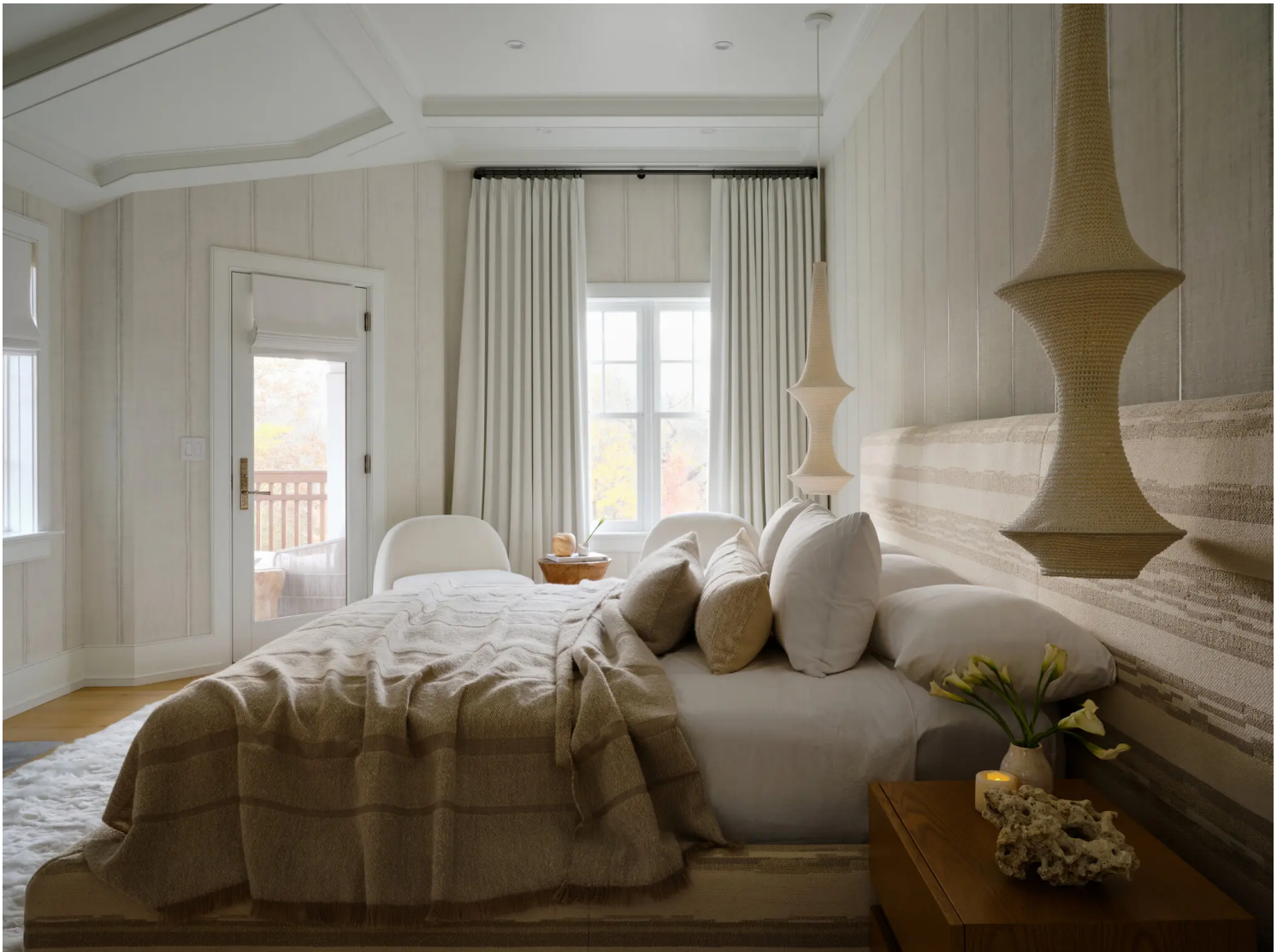
The primary bedroom has a custom bed from Croft House, upholstered in fabric with a metallic stripe from Schumacher, and Saint III crochet pendant lights from Hamimi ($420 each). Lindsay Brown

In the foyer, she installed a rattan-and-mahogany sunburst mirror over a custom marble console and a Bocci chandelier with organically shaped porcelain shades above a braided jute rug.